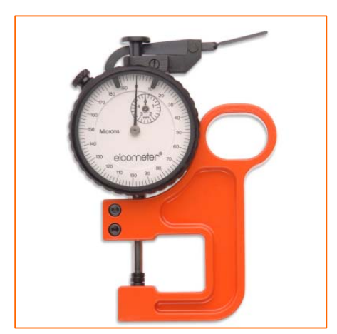
Elcometer 124 Thickness Gauge

The Elcometer 124 Thickness Gauge is used to measure the peak-to-valley height of a surface profile moulded in the Elcometer 122 Testex Replica Tape.