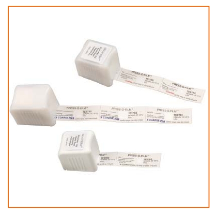
Elcometer 122 Testex® Replica Tape

Elcometer 122 Testex Tape consists of foam with a non-compressible backing. The foam side is rubbed into the surface providing a permanent mould of the peak-to-valley profile, which can then be measured using the Elcometer 124 Thickness Gauge.