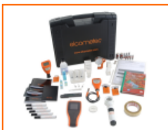
Elcometer Inspection Kits

The new version of the Elcometer 456 now benefits from a larger display for easy data viewing and a simple calibration feature to make testing even quicker. The Elcometer 456 also features Bluetooth® wireless technology for fast data transfer to ElcoMaster™ Software, ideal for easy report generation and archiving of readings.